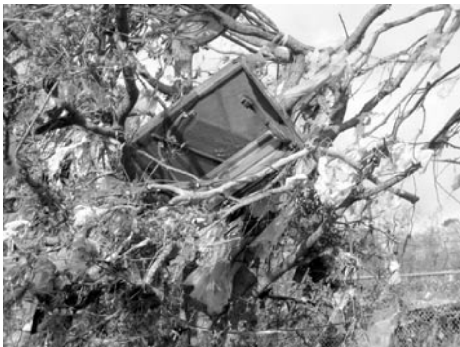
Adding a farcical twist to the tragic scene, an antique piano remained suspended high in a tree caught on a branch where the storm surge had left it.

Broken trees, stripped or toppled billboards and ruined buildings grew more pronounced as we approached the coastline. Approximately six-miles from the Gulf, evidence of the storm surge greeted us. Debris was deposited on the shoulder of the raised roadbed as we reached Interstate 10; plastic bags, shredded fabric and multicolored household goods were strewn in the tree limbs 12 feet from the ground revealing the high-water mark's crest.