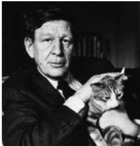
W. H. Auden portrait from The Table Talk of W. H. Auden in Special Collections.

Like a lot of other institutions, libraries have changed a lot in the last fifteen years. I walk by computer labs, snack bars and a media center on the way out of the building. I have used each of these services at some time. For me, though, the library is about the mind—loosening it up, giving it