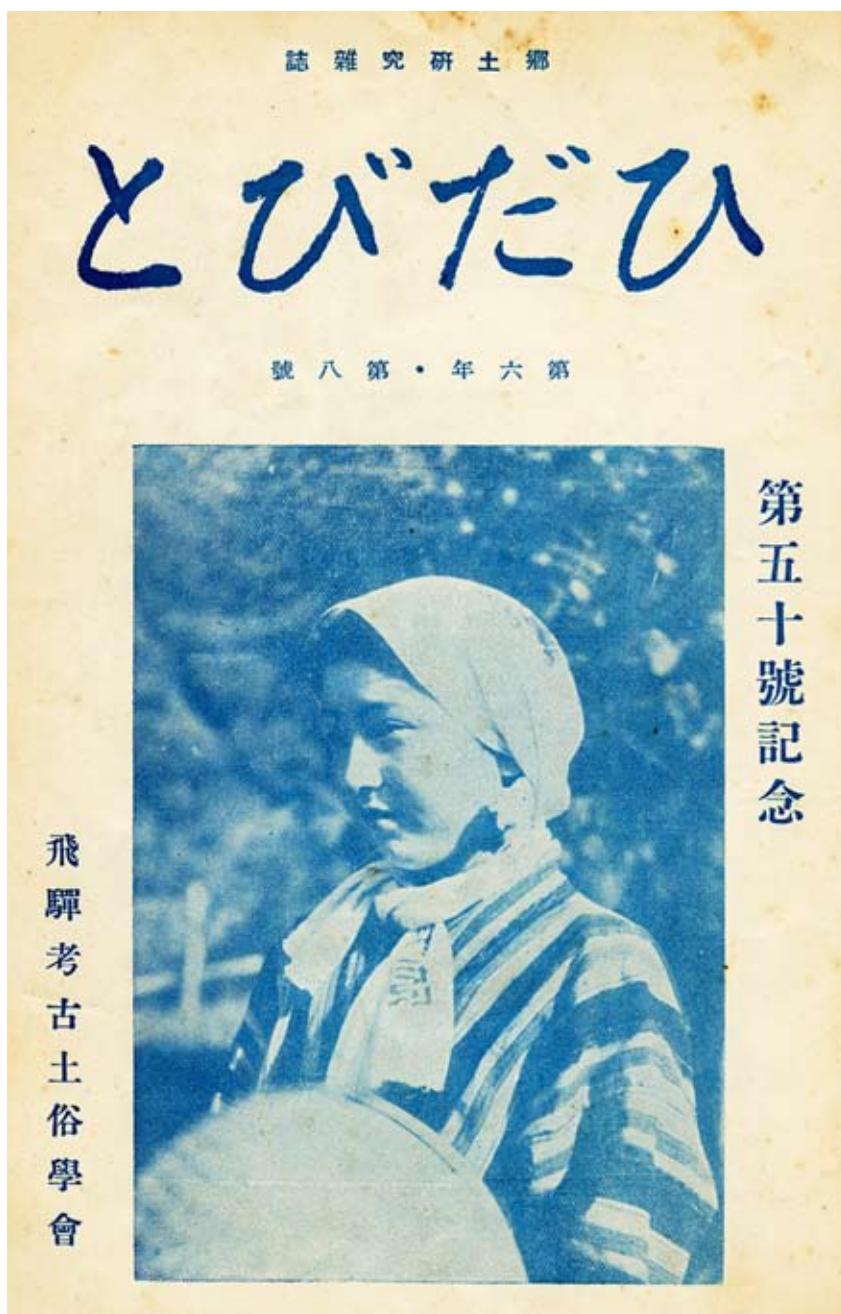
FIGURE 2: Cover of Ema's folklore journal Hidabito (August 1938), commemorating publication of its fiftieth issue. The photograph shows a young farm woman from Miyamura.