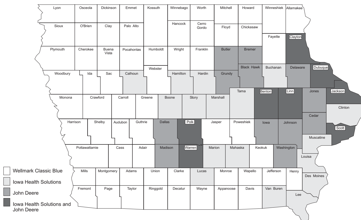
Figure 2. hawk-i health plans by county