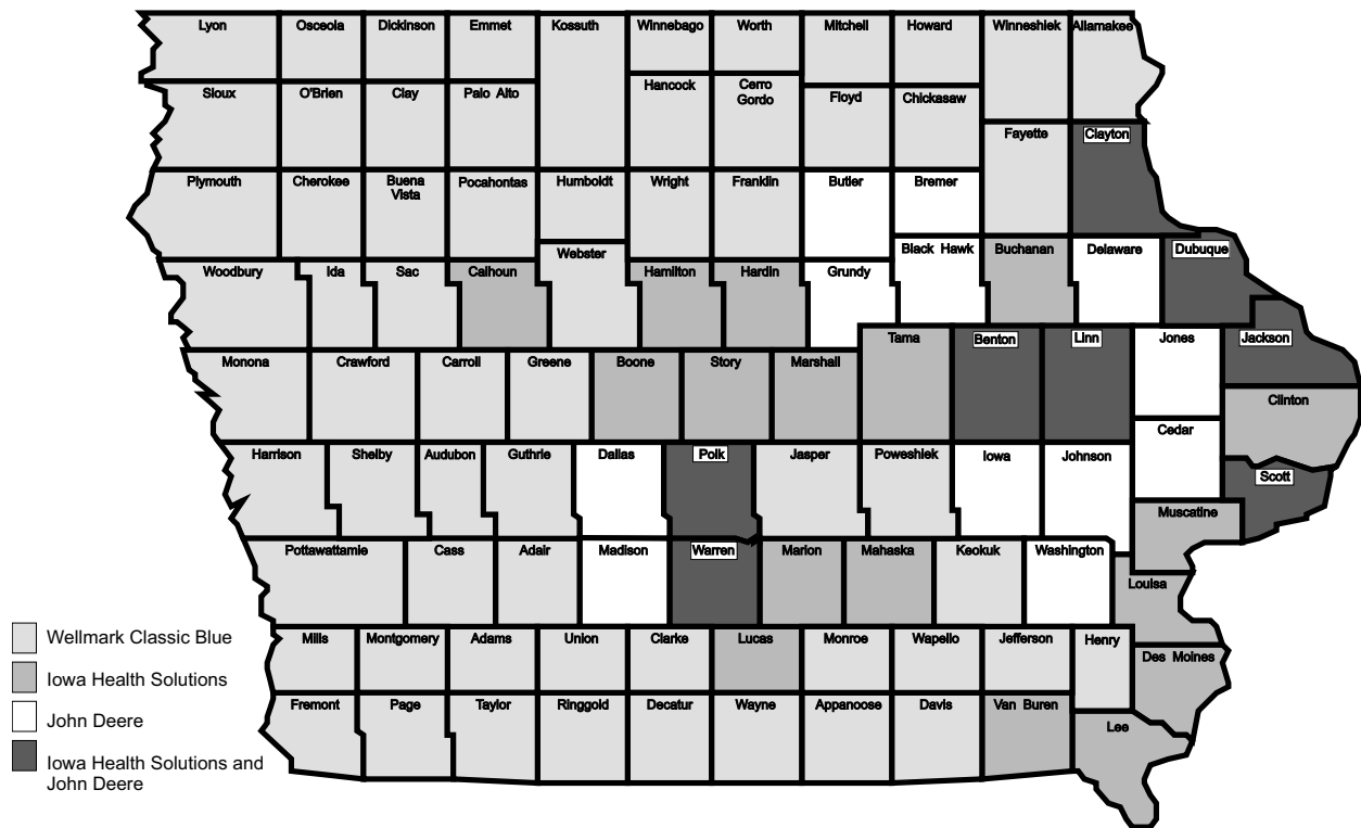
Figure 2. hawk-i Health Plans by County