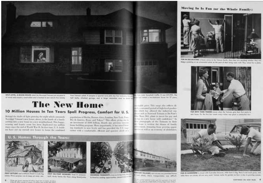
Figure 2. A depiction of a Du Pont family in their home from a 1956 issue of Better Living . Note the comparison with workers' housing in the illustrations and photos at the bottom.