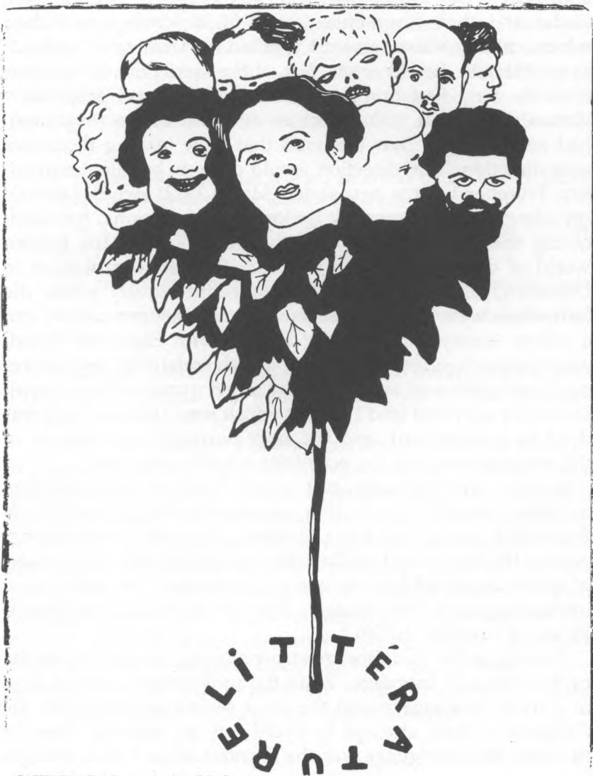
This ironic portrait of some of the Paris Dadaists by Francis Picabia appeared on the cover of Littérature n.s. no. 8 (January 1923).