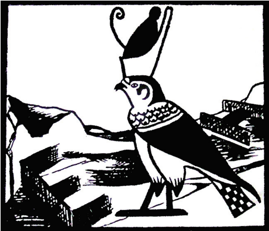
Figure 1: Editions Horus Logo (Le Caire). Dir. Horus Schenouda.

A contemporary of Georges Henein, Horus Schenouda, also alluded to the ancient significance of the hawk: "Le faucon Horus a toujours les ailes déployées dans les effigies, les bas-reliefs et les figures magnifiques qui ornent les temples, les édifices des Pharaons qu'on admire toujours..." (Untitled manuscript 2). ("Horus the hawk always spreads his wings in effigies, bas-reliefs and the splendid figures adorning the temples, these Pharaoh edifices that we still admire...")