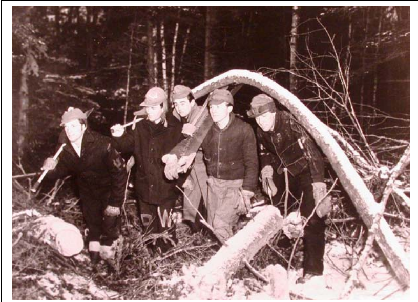
POWs at branch camps worked at a variety of tasks, including logging and brush clearing.

with his sugar beet crop. In September 1945 the Fort Dodge Messenger reported that German POWs from Camp Algona were engaged in clearing trees and brush from roadsides where roadwork was being conducted. 38 The more efficient procurement process also encouraged the establishment of additional branch camps throughout Iowa in 1945 to alleviate labor shortages. 39