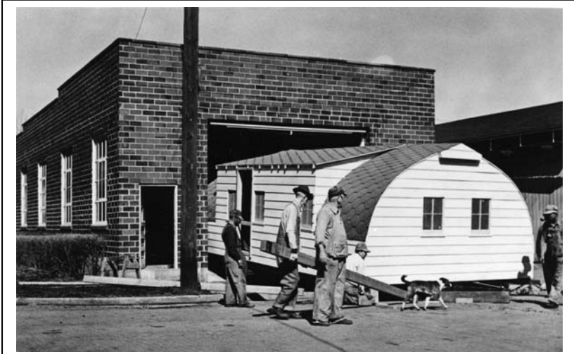
Workers prepare buildings at Camp Clarinda.