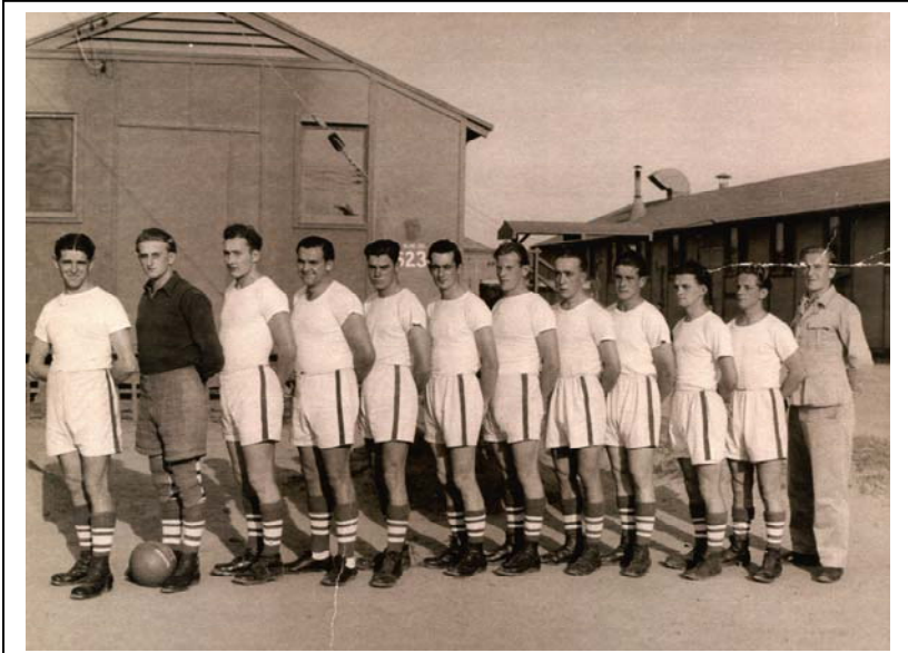
Recreational activities, especially sports, were an important means of combating boredom in the POW camps, thus contributing to a safe and secure environment.

were paid 80 cents per day for work outside of the camp; those who worked within the camp made 10 cents per day. Prisoners had the choice of placing the money earned in a trust fund account to be redeemed upon repatriation or receiving wages in the form of canteen coupons redeemable at the PX. One Camp Algona officer stated, "They aren't interested in saving the money they earn. It doesn't mean anything to them as prisoners. They like real things that they can see and feel and use." 24