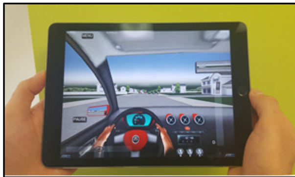
Figure 1. Engaged Driving Training System (EDTS) tablet

Engaged Driving Training System (EDTS) . EDTS is a tablet-based hazard anticipation training program. In this program there are eleven driving scenarios, each with a latent hazard. Participants were asked to hold an iPad Air tablet horizontally with both hands. The tablet itself was the steering wheel. By rotating the tablet clockwise or counterclockwise they were able to move a virtual vehicle left or right. Participants could use their right thumb to accelerate and decelerate until the full stop via a slide bar at right side of the tablet. They were able to scan side to side by using a horizontal slide bar at left side of the screen (Figure 1). Participants were asked to identify hazard areas by pushing the pause button, then tapping at the hazard area. If they did it correctly, the area became green.