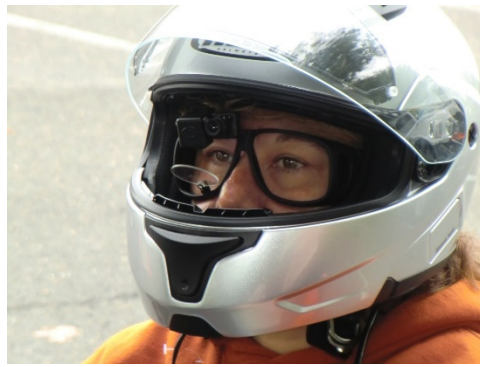
Figure 1. The ASL MobileEye eye tracking system worn under the helmet and visor