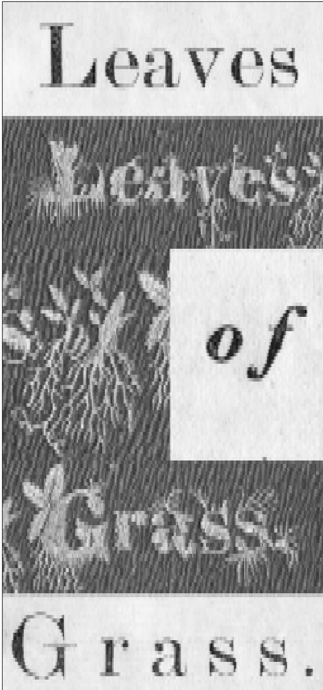
Comparison of fonts for title page and cover of the 1855 Leaves of Grass . See pp. 85-97.