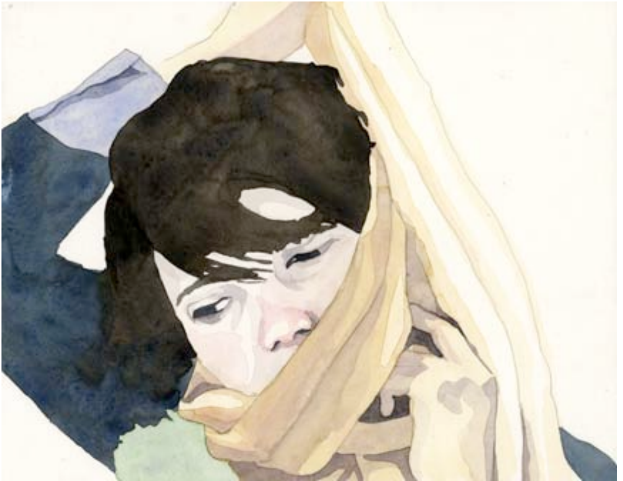
Figure 1. Scarf Series 1 . Watercolor on paper, 8" x 10". 2011