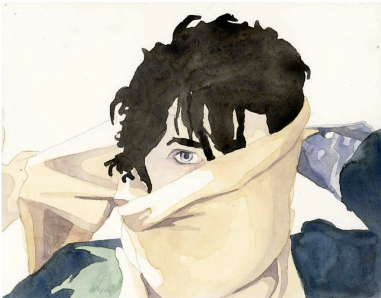
Figure 7. Scarf Series 2 . Watercolor on paper, 8" x 10". 2011.