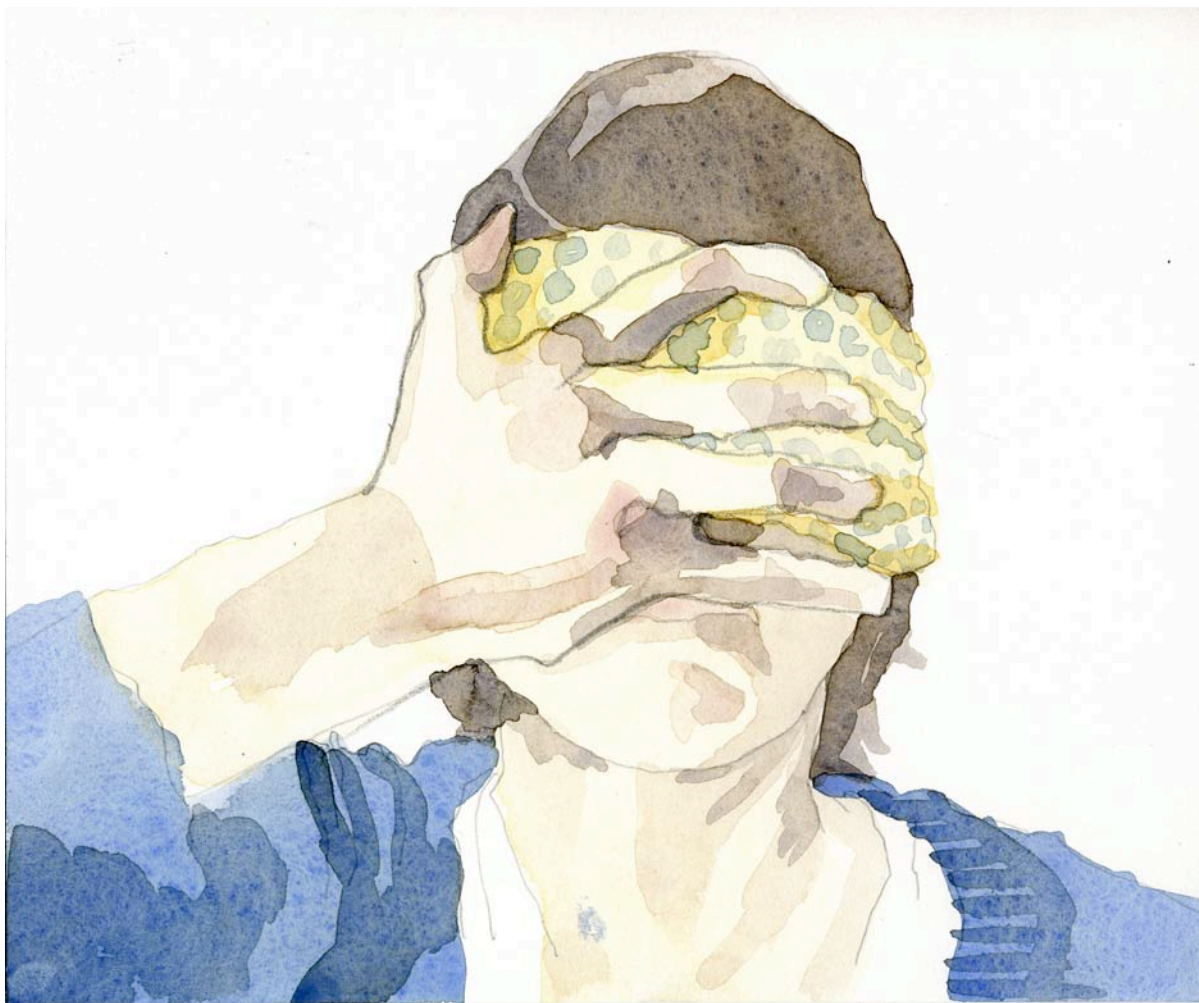
Figure 6. Danielle 2 . Watercolor on paper, 9" x 11". 2010.