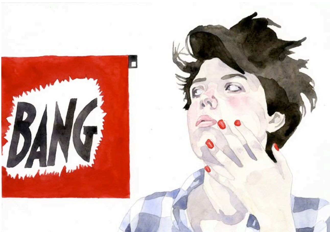
Figure 8. Bang . Watercolor on paper, 10" x 15". 2011.