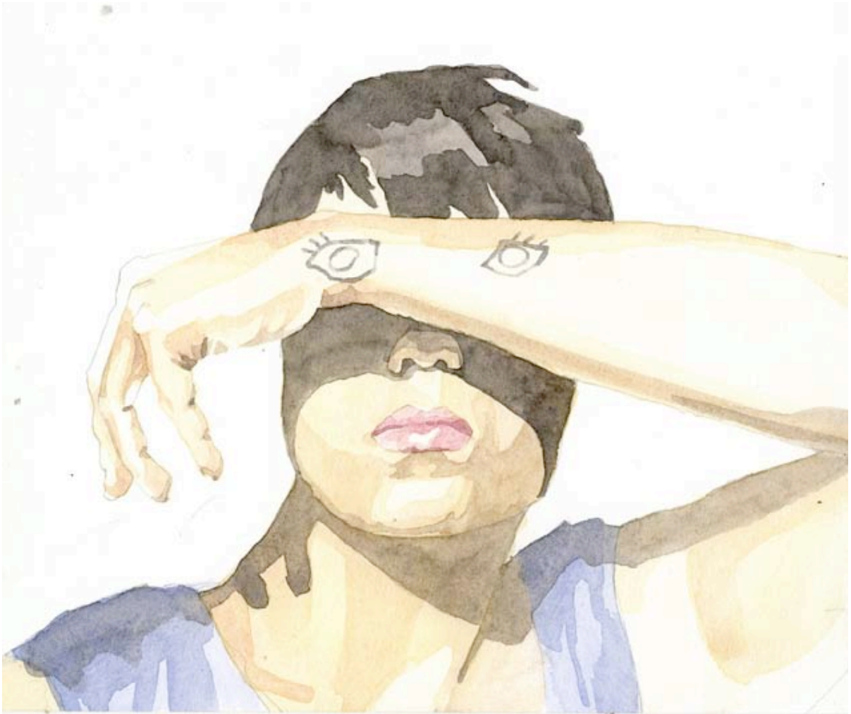
Figure 4. Fore(arm) Sight . Watercolor on paper, 10" x 12". 2011.