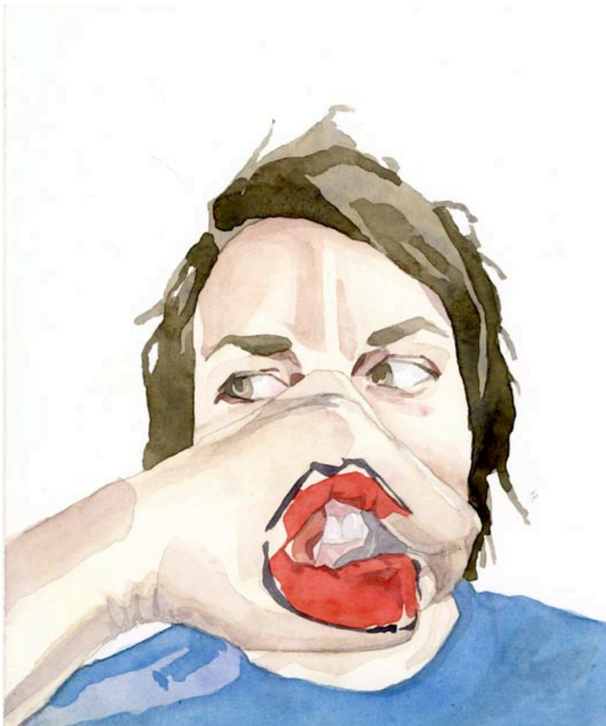
Figure 2. New Mouth . Watercolor on paper, 12" x 10". 2011.