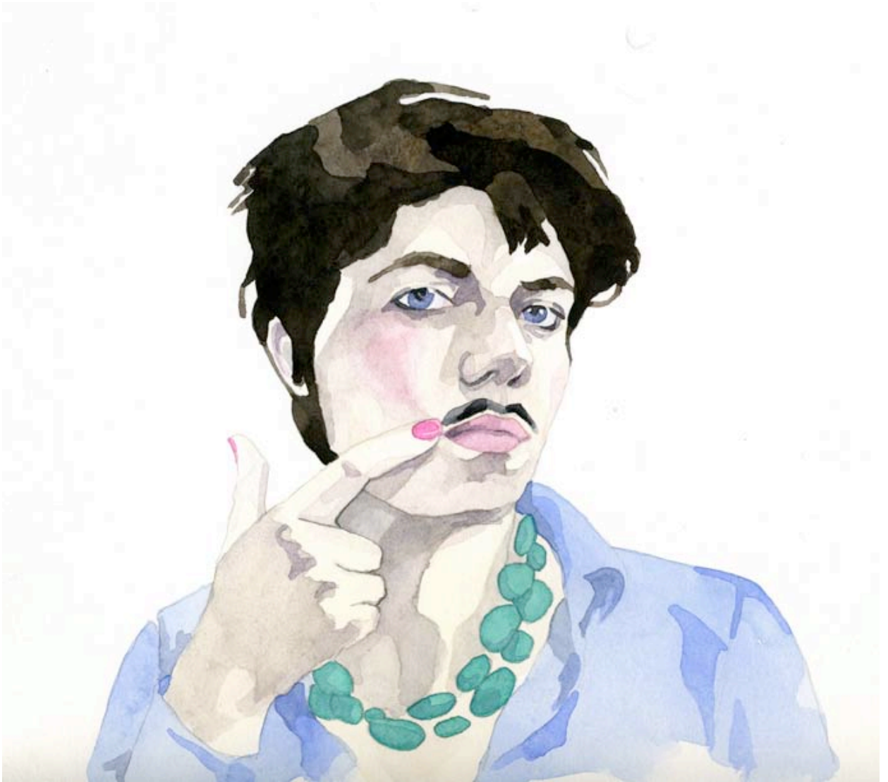
Figure 9. Mustache . Watercolor on paper, 10" x 12". 2011.