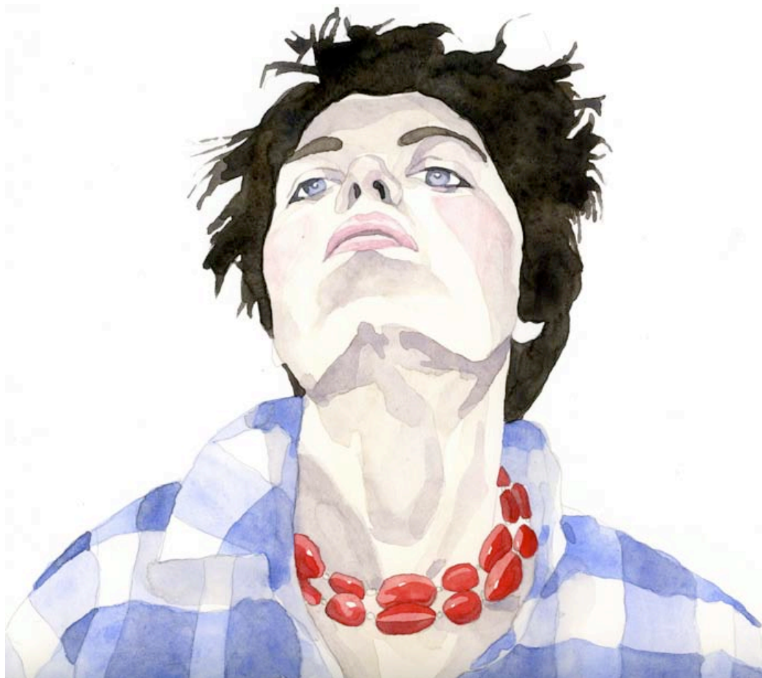
Figure 5. What if Nic Cage Had Died Young? . Watercolor on paper, 10" x 13". 2011.