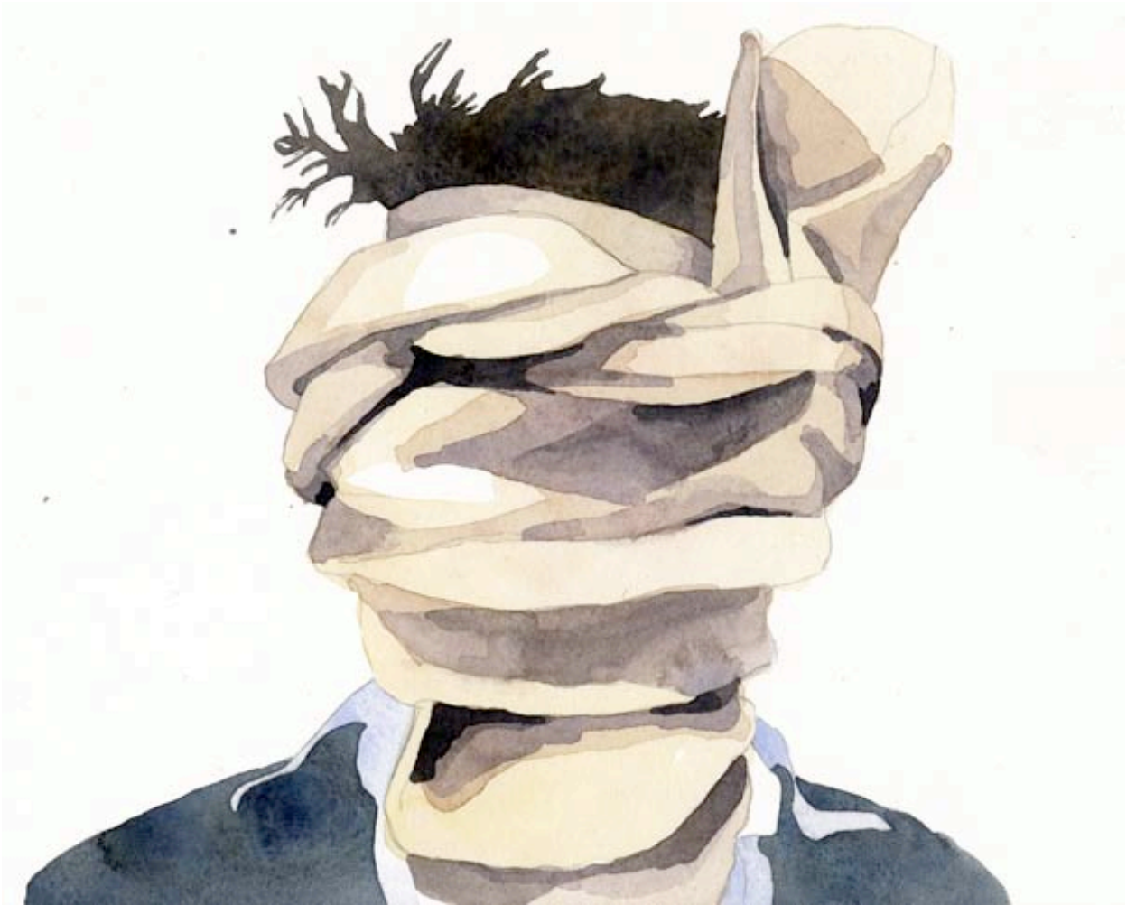
Figure 3. Scarf Face . Watercolor on paper, 8" x 10". 2011.