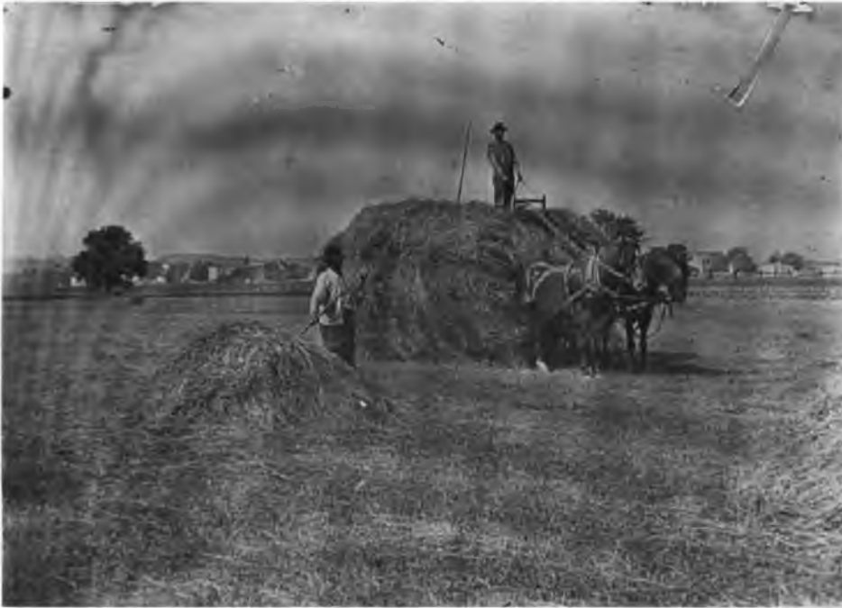
FIGURE 8. Loading hay, Jacob Rapelje farm, New Lots, c. 1890.

It was considered in times gone by rather a sign of a well-to-do farmer to have a large family of colored people in his kitchen. . . .