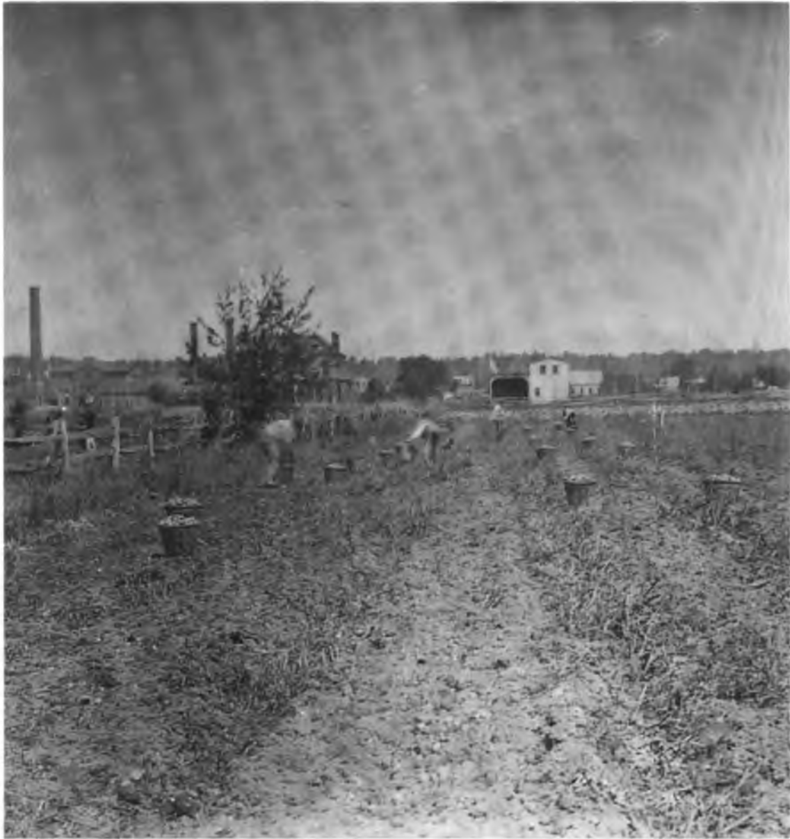
FIGURE 9. Workers harvesting potatoes, Jacob Rapelje farm, New Lots, c. 1890. The smokestacks in the background reveal the advance of urbanization.

relays of teams for field and market work especially on days when several wagon loads were marketed — many of which died in an almost nationwide epidemic. 44