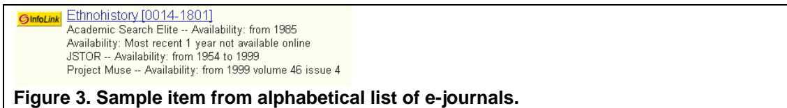
Figure 3. Sample item from alphabetical list of e-journals.

SFX can also be used to generate an alphabetical list of e-journals, with an availability statement for each full-text target. Figure 3 shows an example with two different targets.