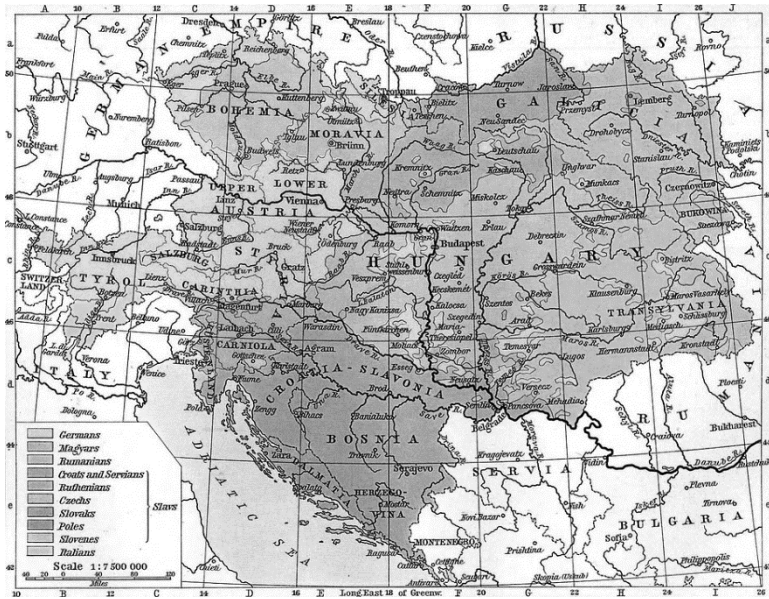
Figure 3: A Map outlining Austria, Hungary, and Bosnia. Royalty free image from Pixabay.com.

In “Environmental Justice Storytelling: Angels and Isotopes at Yucca Mountain, Nevada,” (for which this paper is partially named), Donna Houston argues that “(1) the disruption of the continuity between past and present reveals a plurality of stories that shape alternative practices; and (2) these alternatives are often invisible, fragmented and no longer available to us as direct experience but are sustained through storytelling and imagination.” 13 Storytelling opens up spaces of possibility, possibilities, my father whole-heartedly believed in.