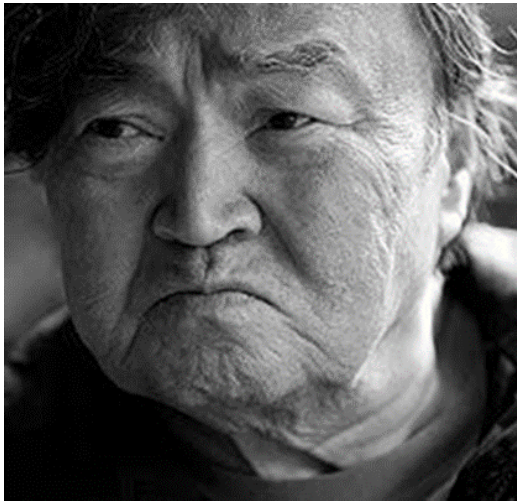
Figure 4: Poet and activist Olzhas Suleimenov.

While my father headed north to Austria, Soviet tanks rolled south into Budapest. And twelve hundred miles away, on the other side of Europe, an academic watched from afar and contemplated an alternate future for Marxism. "I came into Marxism backwards," Hall would later quip, "against the Soviet tanks in Budapest." 17 In Hope in the Dark , Sonit, contemplating, herself, on the difference between hope and faith, writes that, "Every act is an act of faith, because you don't know what will happen." 18 Our actions count. We make history all the time, even