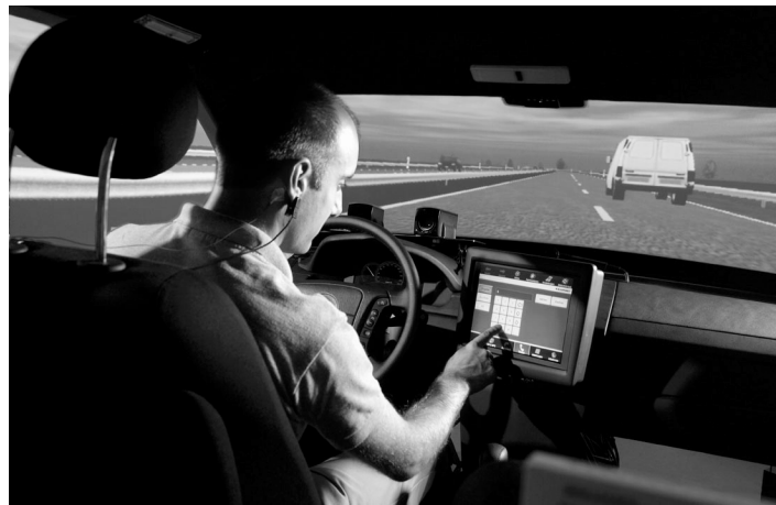
Figure 1. The Bosch driving simulator with the touch screen for interaction with the IVIS

Navigation and traffic information system. A standard type of navigation system was simulated through the touch screen and required the driver to insert a given destination using an on-screen keyboard (Figure 1). The information system announced traffic jams, road construction sites and motorway exits both via the audio system and by using signs within the road scenario. Adaptivity was realized through postponing and rescheduling of messages with lower priority.