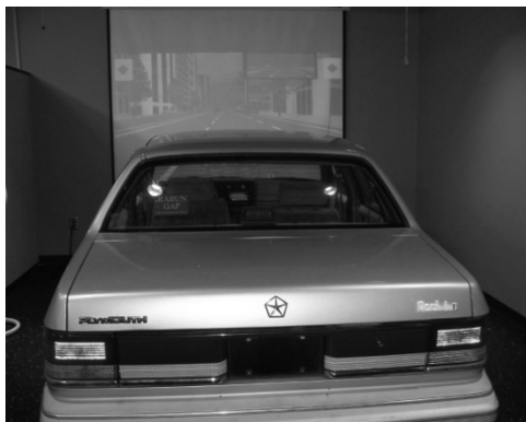
Fig. 1 Driving Simulator Set-up

Only those that met all study criteria and were considered not likely to become simulator sick were further assessed in a STISIM Model 300 driving simulator incorporated into a full-sized Plymouth Acclaim, 1991 sedan car. While in the simulator, participants were instructed in a standardized manner to use all operational parts (steering wheel, gas and brake pedals, seat belt and turn signals) of the car as in real life to navigate presented simulated driving scenarios. To get familiarized with driving simulation, participants first drove through a simulated 2 mile scenario containing simple traffic events which was projected with 50 degrees field of view on a 9 square feet screen mounted on a wall 2 inches in front of the stationary car (figure 1). After verbal declaration of familiarization, participants were presented a 9.5 mile long scenario. The scenario contained simulation of a regular 10.30 am work day traffic stream on a popular route around Augusta, GA (figure 2) which was previously recorded on video. The route predominantly comprised of 4-lane (2 lanes in each direction) undivided urban/city roads with 12 signal controlled intersections and an interstate highway with 2 entry/exit single lane ramps. Speed limits along the route ranged from 30 to 70 mph.