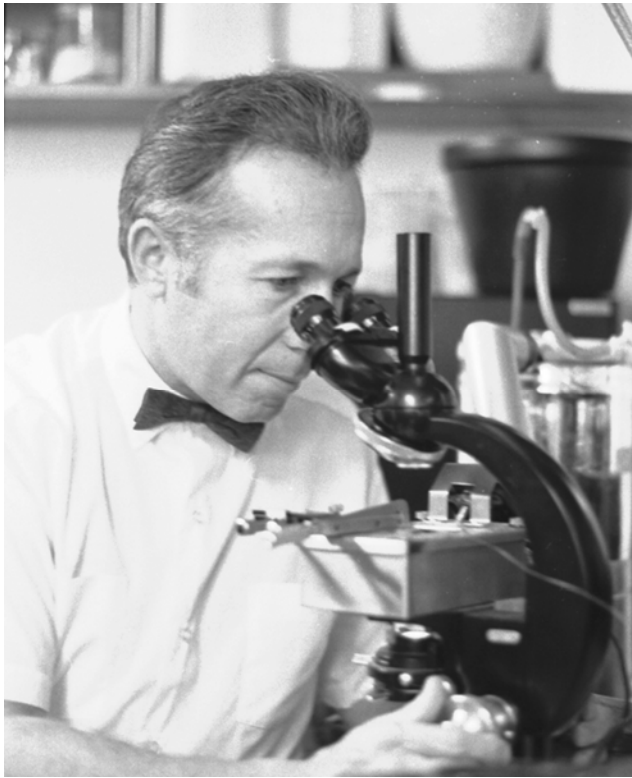
Dr. Jerome Sherman at work in 1971 at the University of Arkansas.

Despite the work that Sherman performed over a half-century to develop and promote sperm banks, decades elapsed between the Iowa babies as living proof of the concept and its acceptance. Frozen semen repositories may have been possible, but they were not desirable until assisted conception became more frequently used and accepted as a positive intervention. With each reemergence of the “test tube baby”—in the 1930s, the 1950s, and the 1970s—the medical and social landscape had changed, requiring Americans to recalculate the benefits and risks of these new conceptions. After 1953 the persistent per-