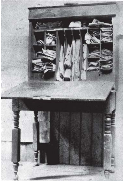
Figure 1. “Walt Whitman’s desk in the Brooklyn Times office (1891).” From Alexander Black’s Time and Chance: Adventures With People and Print (New York: Farrar and Rinehart, 1937), 74.

WHEN THE EDITOR of the Brooklyn Daily Times from 1885 to 1905 inherited what was known as “Walt Whitman’s desk,” his curiosity regarding the relic was piqued. 1 Dissatisfied with the accounts of “survivors of an earlier day” who “knew about Whitman and his habits, and where the desk used to stand,” Alexander Black took the story to its source in 1891. 2 His letter of inquiry to Whitman was returned on May 12, along with Black’s photo of the desk (see Figure 1).