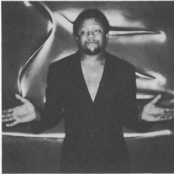
Quincy Troupe — poet — '80