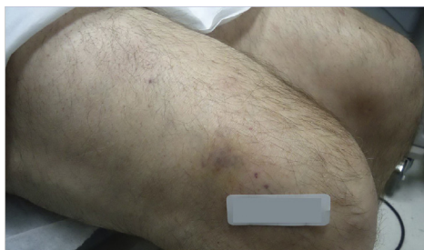
Fig 1. Three-centimeter right lower extremity nodule.