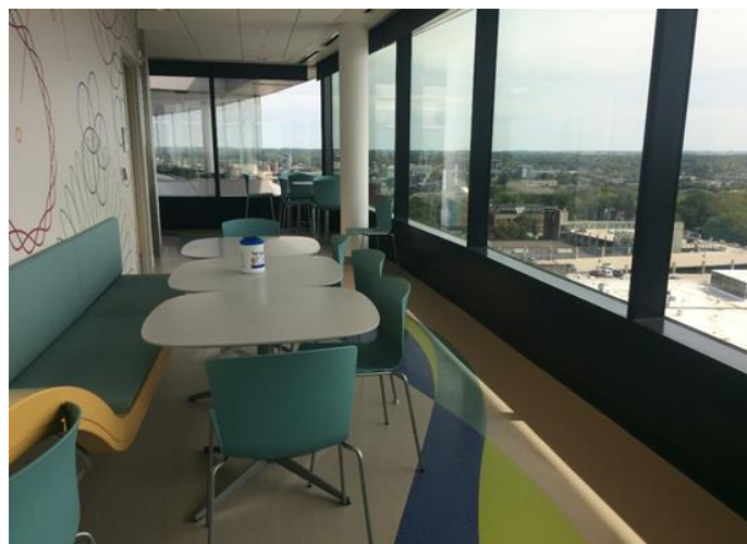
Figure 2: The Press Box Cafe in the UI Stead Family Children’s Hospital. The location where the event nights were hosted.

For my outreach program I brought a variety of STEM activities to the pediatric patients in the form of ‘Science Nights’. The target audience of this project was 3rd to 5th grade, however each activity done during these programs was carefully chosen to be applicable to children of all ages.