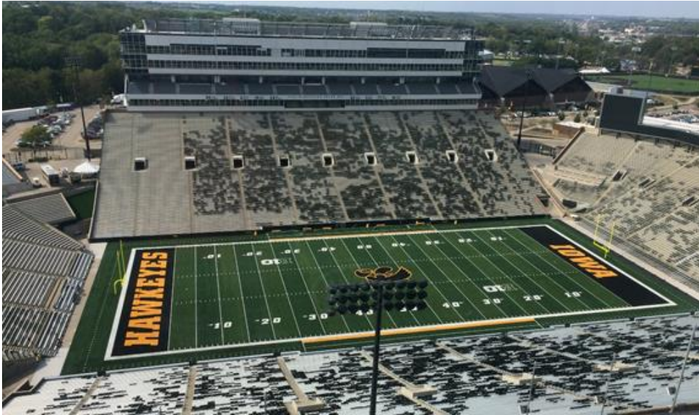
Figure 1: View of Kinnick Stadium from the 12th floor of the University of Iowa Stead Family Children’s Hospital. This image was taken from inside the program event room, the Pressbox Cafe.

The average length of stay of pediatric patients at the UI Stead Family Children’s Hospital is 9.96 days. As a result of their extended or frequent visits to the hospital, pediatric patient often can miss key lessons in school that ultimately inspire higher learning in STEM.