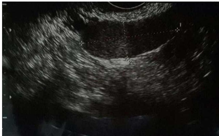
Figure 1 Ultrasound image demonstrating pelvic mass.

She had no background or family history of related diseases. After six months of follow-up there was no decrease in the size of the pelvic mass. After obtaining the patient's consent total abdominal hysterectomy with bilateral salpingo-oophorectomy was performed. Intraoperative exploration revealed a 40 mm sized suspicious mass immediately adjacent to the right fallopian tube. The histopathologic examination of the specimen reported normal splenic tissue with polymorphous small lymphocytes, granulocytes, and frequent hemosiderin laden macrophages. No pelvic mass was detected in the postoperative first and sixth months of follow-up and patient's pain disappeared after the surgery.